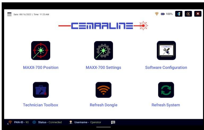
MAXX-700 Application Start Page